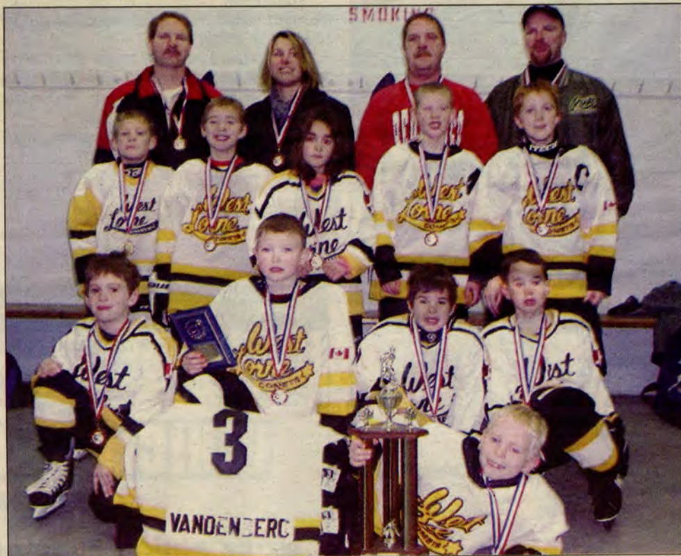
RIDGETOWN CHRISTMAS CLASSIC CHAMPS...