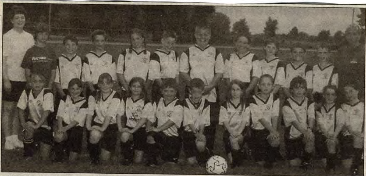
RODNEY SOCCER U 11

The team's next home game is Dec. 4 at 7:15 p.m. versus the Lucan Irish.