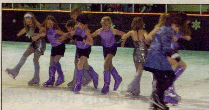
Many musical eras were represented at "Retro Mania".